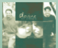
Album Cover: Not Ordinary